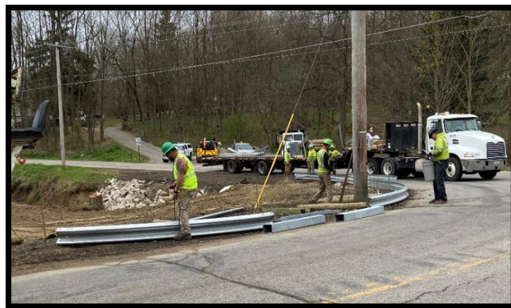
New Guardrail Install