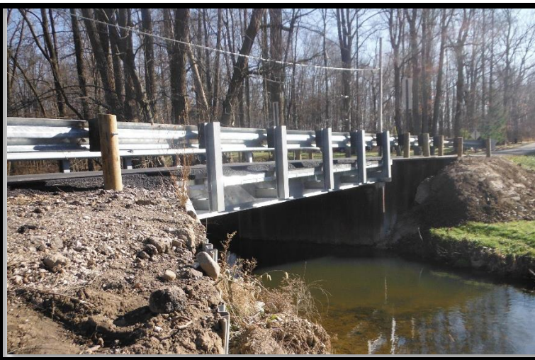
Lohr Road – Steel Beam Replacement