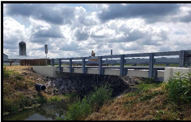
Shelby-Ganges Rd – Concrete Box Beam Bridge