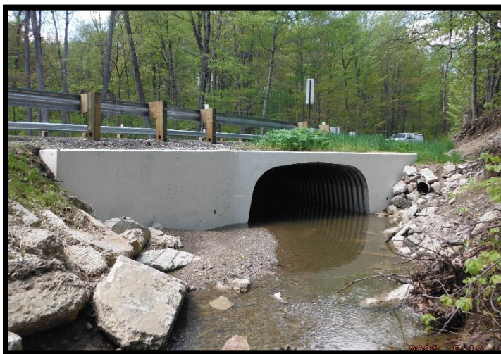
Snodgrass Road – Aluminum Box Culvert