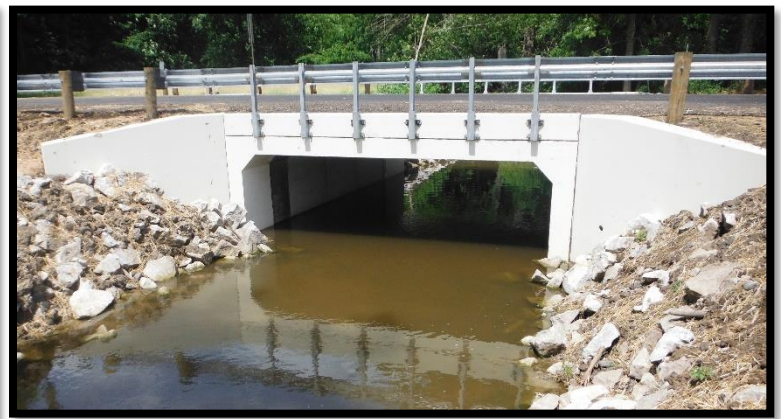
Wells Road – Concrete Box Culvert