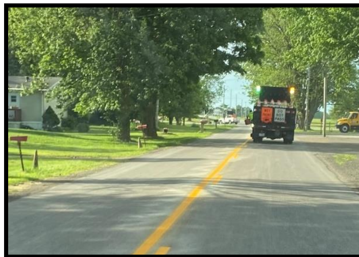
New Centerline Striping