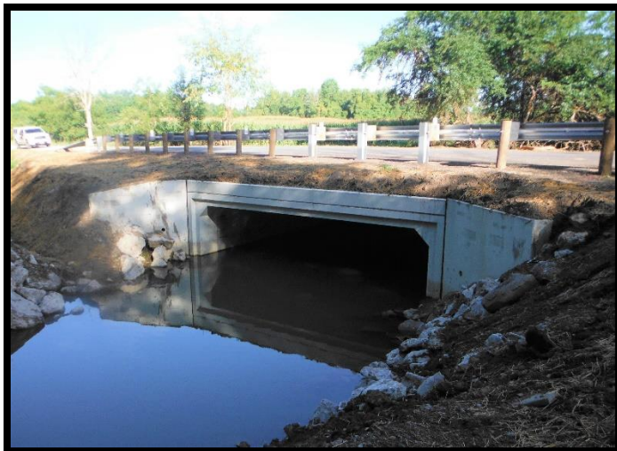
Pittenger Road – Concrete Box Culvert