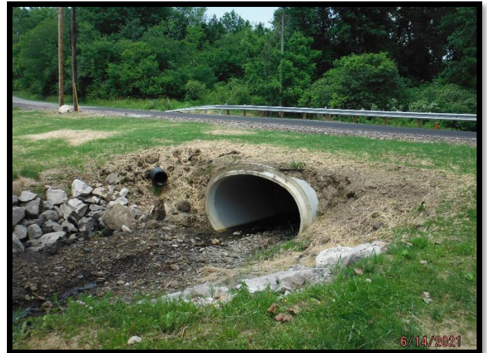
Fleming Falls Road – Elliptical Pipe