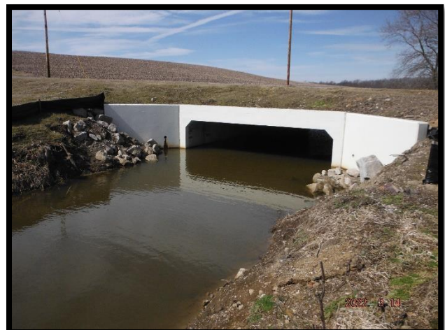
Snake Road – Concrete Box Culvert