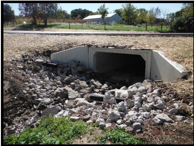
Reynolds Road – Concrete Box Culvert