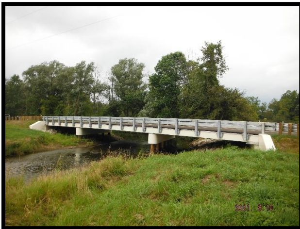
Mock Rd – Concrete Box Beam Bridge