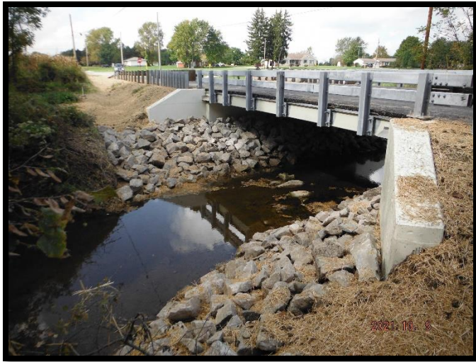
Stein Road – Concrete Box Beam Bridge