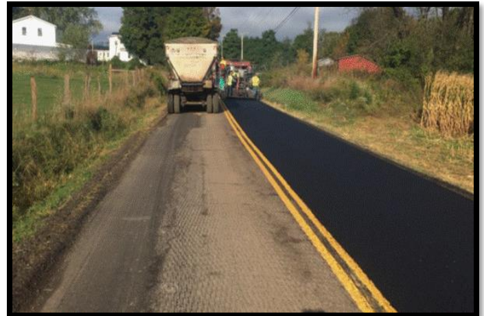
Asphalt Resurfacing (Bellville-Johnsville Rd)